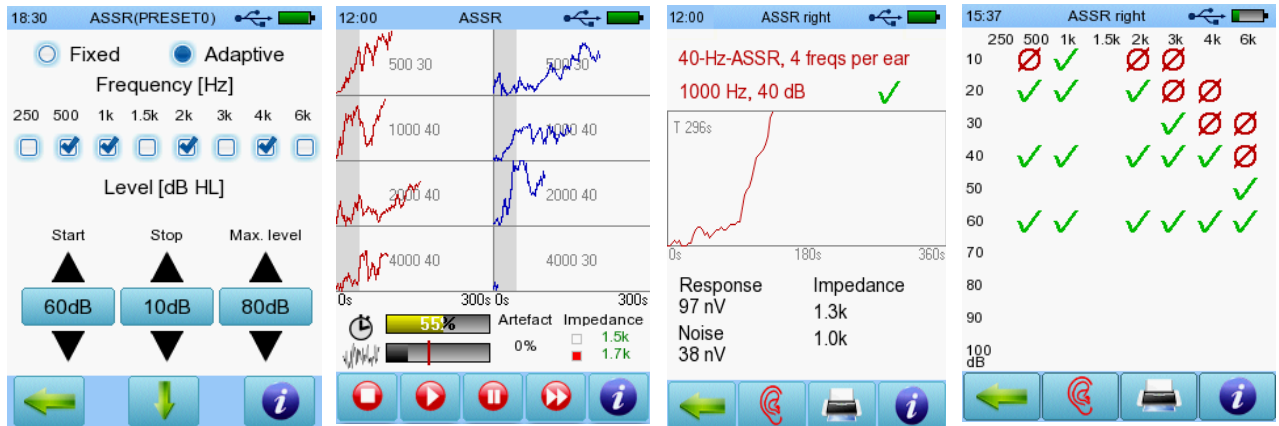
Settings 250 Hz – 6 000 Hz 10 dB – 100 dB, single or multiple levels, frequencies

In contrast to competing manufacturers of ASSR devices, Sentiero is the only device to perform diagnostic ASSR on a battery powered handheld device (power loss? No problem!) in a non-sedated setup in any room. Record ASSR anywhere: Child's bed, surgery, audiology booth etc. External sources of electrical interference have much less impact on the new weighted averaging algorithms.